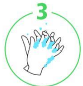
In between the fingers