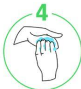
The back of the fingers