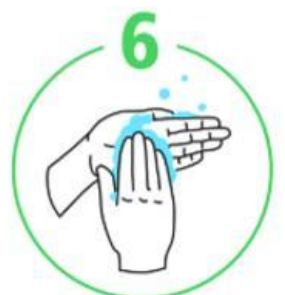
The tips of the fingers