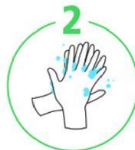
The backs of hands